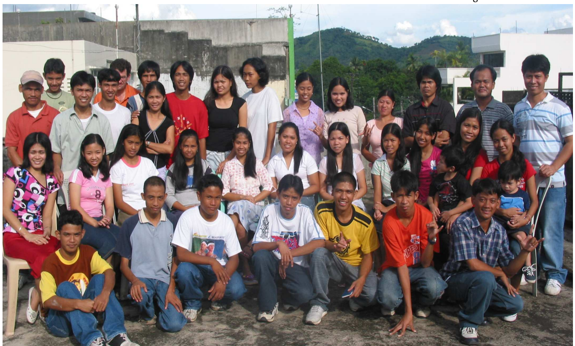
Ligao church members