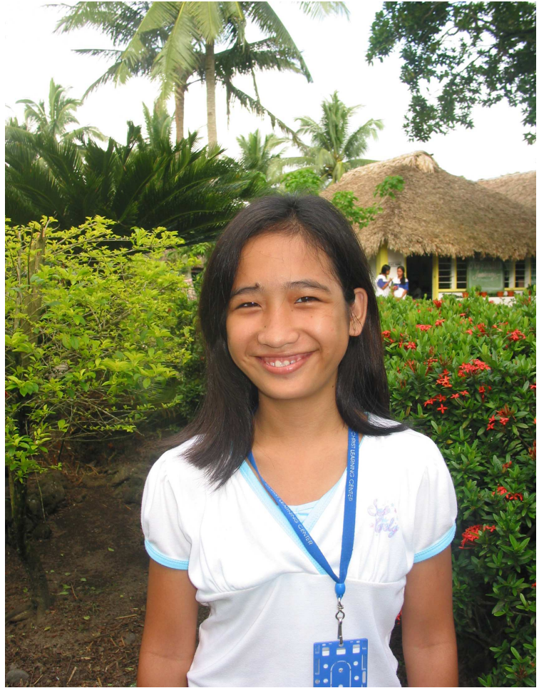
Would you like to sponsor this Filipino teenager?