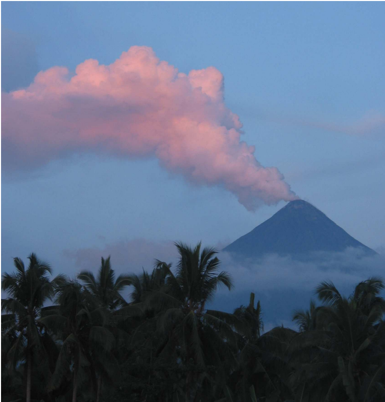
Mayon - view from DMI school farm, 12km away