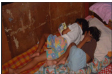
Sleep is important