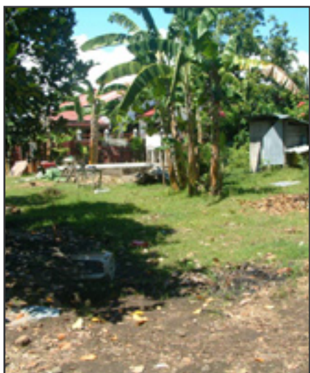
The new site, not far from the old dormitory.

School for the deaf so children can walk to school in about 5 minutes. This block of land is a 600 square meter above the flood level, is on a dead end street so there is no through traffic and in all is a very safe and quiet place to be. Neighbors consist of a Christian Missionary Alliance church opposite, an empty block of land to the west with the rest of the street being made up of private homes. The land is fully owned by Deaf Ministries International, Philippines.