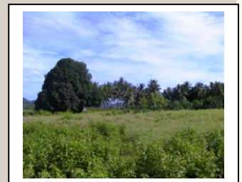
Possible land use: pigs, chickens, goats, cows, rice, corn, mango, papaya, coconut, sugar cane, cassava